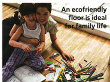
An ecofriendly floor is ideal for family life

biodegradable, and offers excellent thermal and acoustic insulation.